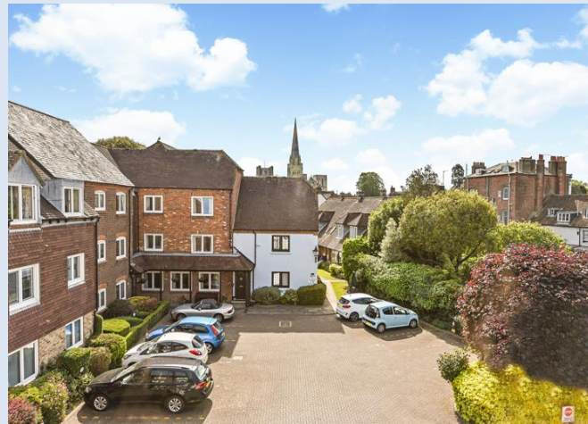
View from No 60